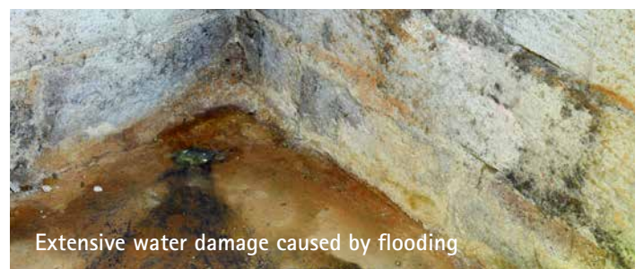
Extensive water damage caused by flooding

By leveraging our advanced sampling suite, insurers and loss adjusters can gain valuable insights into the extent of damage caused by floods, allowing them to accurately assess the necessary restoration measures to ensure buildings meet current safety standards. Our efficient and accurate testing procedures enable swift decision-making, facilitating prompt remediation efforts and ultimately minimising health risks for occupants.